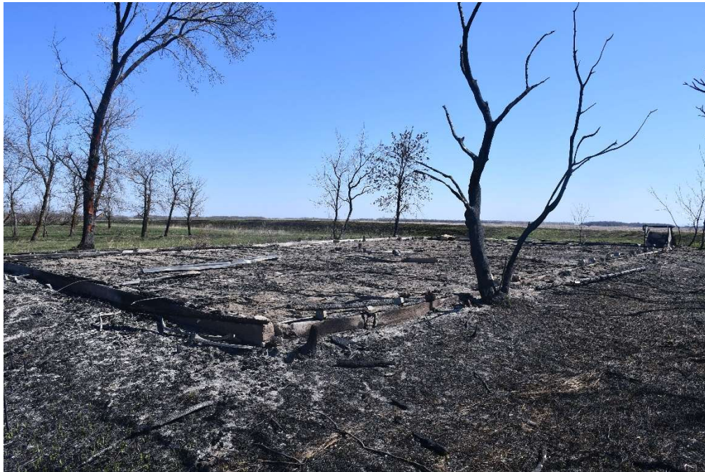
Figure 4 Photograph DSC_0031.JPG Southwest Corner Of Garage Facing Northeast

Investigation Title: WALHALLA VERVILLE FIRE