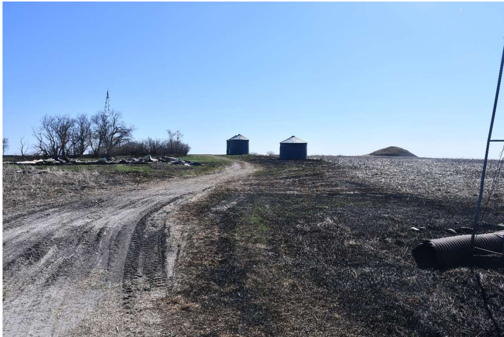
Figure 2 Photograph DSC_0007.JPG Southernmost Portion Of The Farmyard Facing Grain Bins Along The Field And Farm Yard Facing East

Investigation Title: WALHALLA VERVILLE FIRE