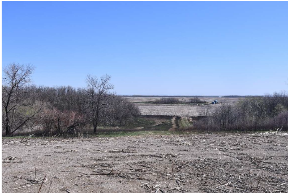
Figure 7 Photograph DSC_0096.JPG Hillside Along West Side Of The Property Facing East

Investigation Title: WALHALLA VERVILLE FIRE