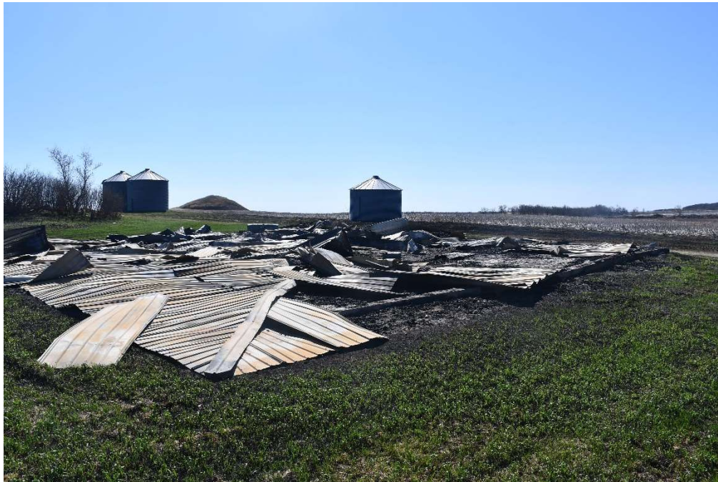
Figure 3 Photograph DSC_0015.JPG Northwest Corner Of Barn Facing Southeast

Investigation Title: WALHALLA VERVILLE FIRE