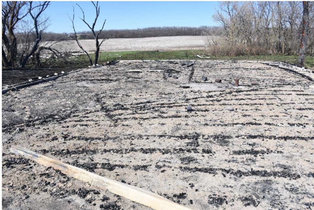
Figure 9 Photograph DSC_0042.JPG West Interior Wall Of Garage Facing West

Investigation Title: WALHALLA VERVILLE FIRE