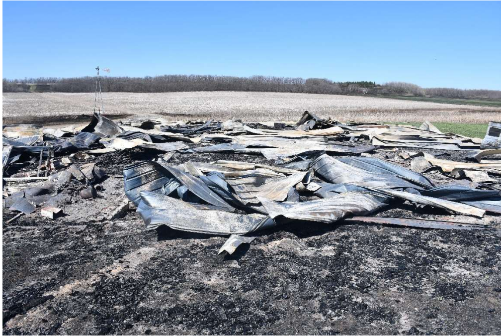
Figure 8 Photograph DSC_0021.JPG Interior Southern Half Of Barn Facing West

Investigation Title: WALHALLA VERVILLE FIRE