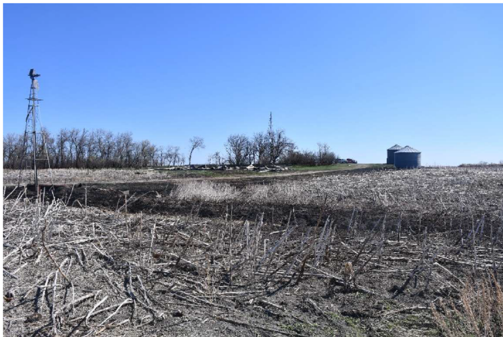
Figure 1 Photograph DSC_0003.JPG Southwest Corner Of Farmyard Facing East

On Friday, April 25, 2025, at approximately 8:30 pm, Fire Chief Mitch Lee of the Walhalla Fire Department received a telephone call regarding a grass fire in rural Northeast Cavalier County. Fire Chief Lee responded to the scene and observed a slowly moving grass fire and two impacted buildings that were already consumed and collapsed. Walhalla Fire Department was dispatched to extinguish the fire. (See Figure 1)