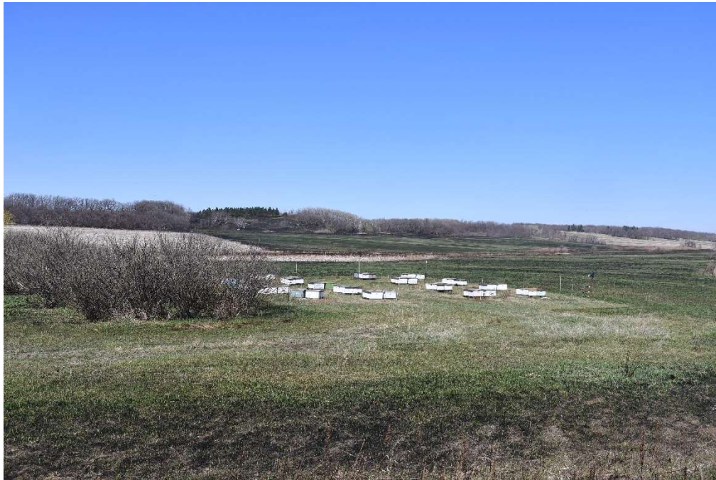
Figure 5 Photograph DSC_0057.JPG Northernmost Portion Of Farmyard Facing West By Bee Boxes

Investigation Title: WALHALLA VERVILLE FIRE