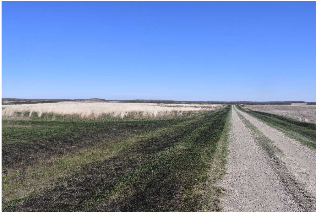
Figure 6 Photograph DSC_0063.JPG CRP Field Along West Side Of North/South Driveway Facing North

Investigation Title: WALHALLA VERVILLE FIRE