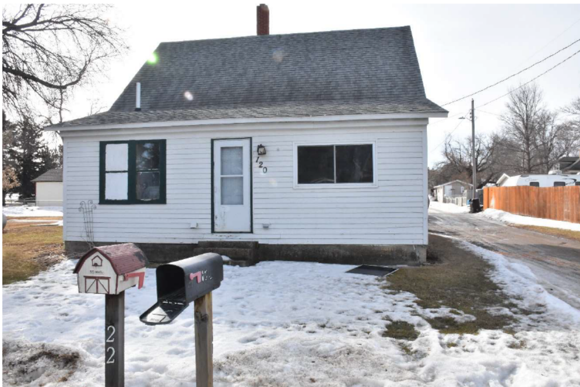
Figure 1 Photograph NJF_0009 North side of the structure with no fire or smoke damage.

A fire occurred in a two-story residential structure with a basement at 120 Central Ave E in Sawyer, ND. The fire was reported on February 26, 2025, at approximately 8:53 AM. The Sawyer Fire Protection District responded and extinguished the fire. The property tenant was not home at the time of the fire and a passerby called 911. (See Figure 1)