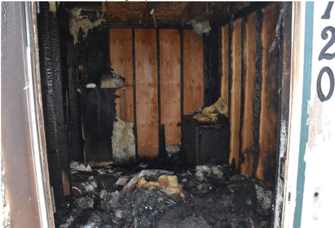
Figure 6 NJF_0019 Mudroom

Based on the fire scene examination, witness statements, and other data reviewed, the area of origin was determined to be in the mudroom. (See figure 6)