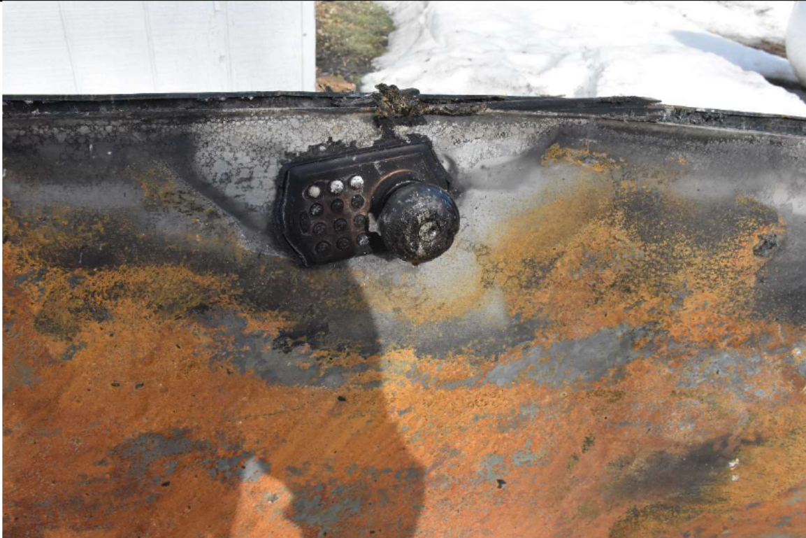
Figure 5 Photograph NJF_0123 Exterior door with mass loss of the latch mechanism

Investigation Title: SAWYER RICHARDSON FIRE