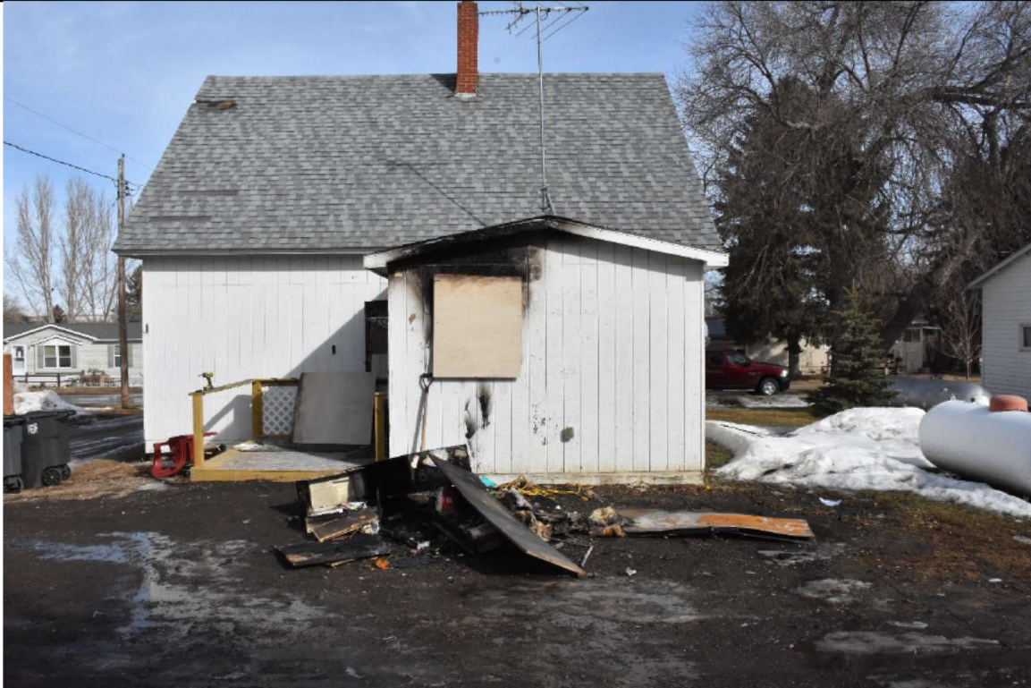
Figure 2 Photograph NJF_0001 South side of structure

Investigation Title: SAWYER RICHARDSON FIRE