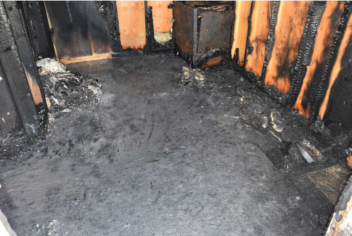
Figure 4 NJF_0106 Mudroom layering process completed

The layering process was performed in the mudroom and items found through the process was to include, lithium-ion batteries, small electrical motors, electrical wiring with mass loss of electrical wiring insulation, paper, cardboard, clothing and plastic materials. (See figure 4)