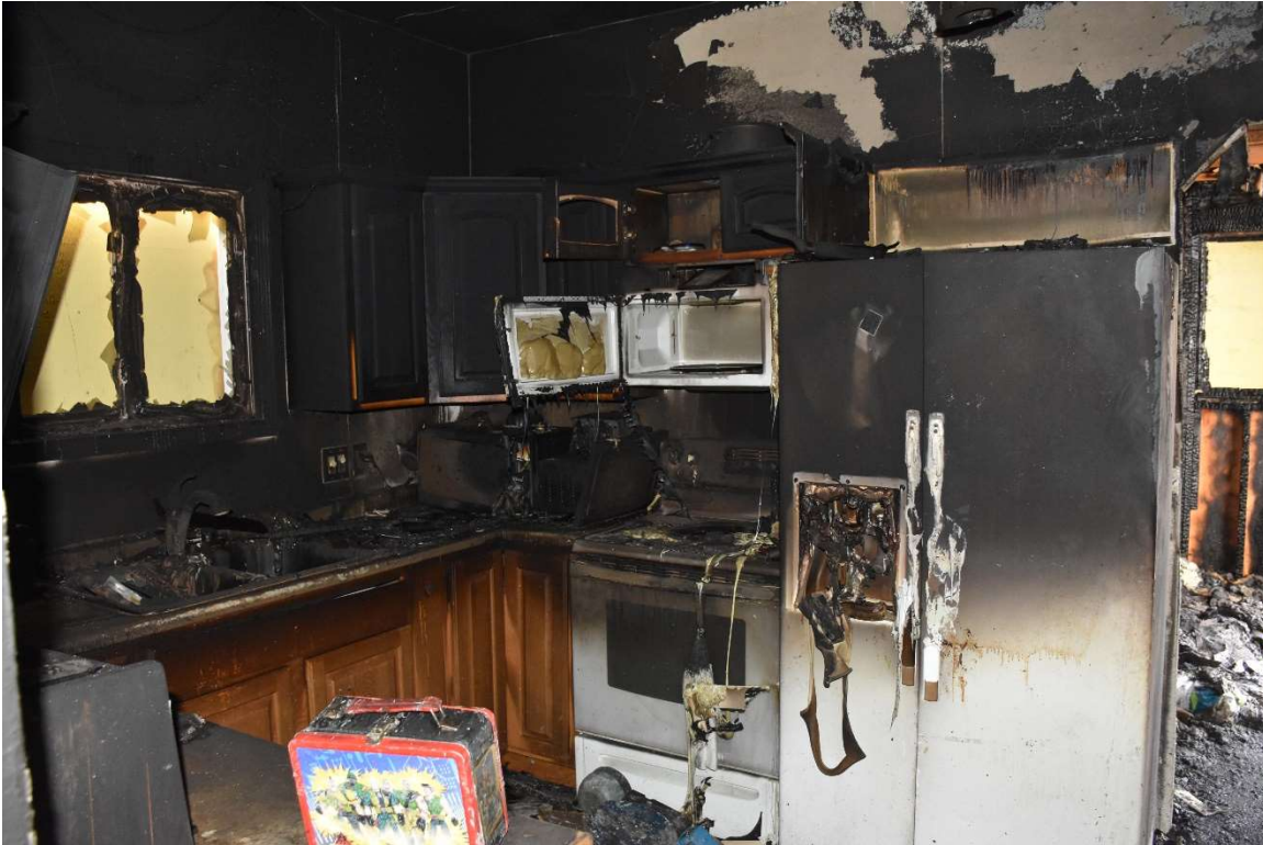
Figure 3 Photograph NJF_0066 Kitchen, south wall with charring to cabinets and deformation and melting of plastics.

The kitchen received smoke staining to the walls and counter tops. Plastic melting and deformation was observed on the microwave and refrigerator. Charring and smoke staining to the upper cabinets. The window in the kitchen was broken and boarded up prior to arrival on scene. (See figure 3)