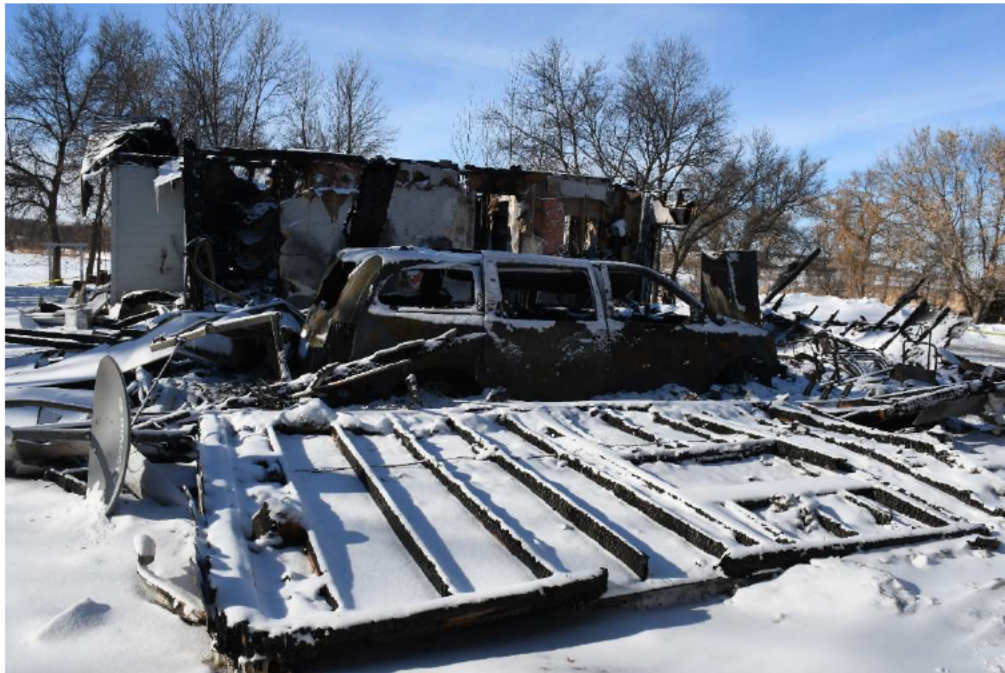
Figure 10 Photograph DSC_0021.JPG Garage, Roof Consumption/Collapse, Wall Consumption/Collapse, Noncombustible remains of Vehicle

Investigation Title: BURLINGTON NELSON FIRE