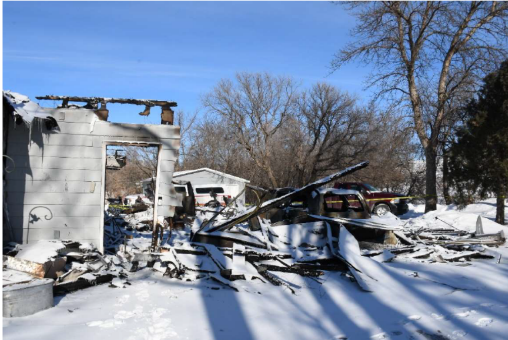
Figure 4 Photograph DSC_0018.JPG Exterior South Side of Garage, Consumption/Collapse

Investigation Title: BURLINGTON NELSON FIRE