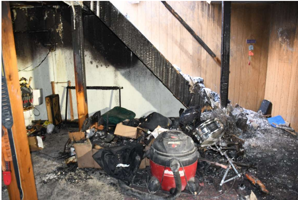
Figure 6 Photograph DSC_0044.JPG Staircase, Sofa Remains, Wood Paneling Char, Charring on Handrail

charring compared to the rest of the beam. Miscellaneous tools and an orange extension cord within proximity to the sofa. (See Figure 6)