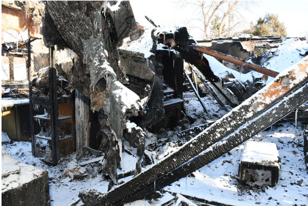
Figure 8 Photograph DSC_0120.JPG Living Room Area

Investigation Title: BURLINGTON NELSON FIRE