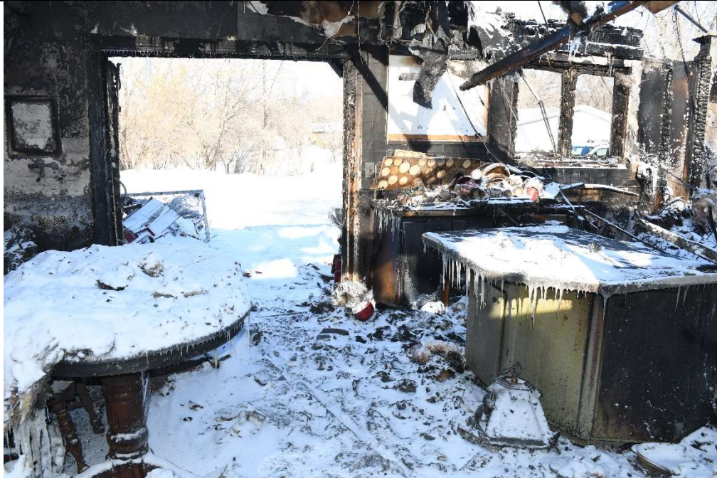
Figure 9 Photograph DSC_0126.JPG Dining Area, Kitchen

Investigation Title: BURLINGTON NELSON FIRE