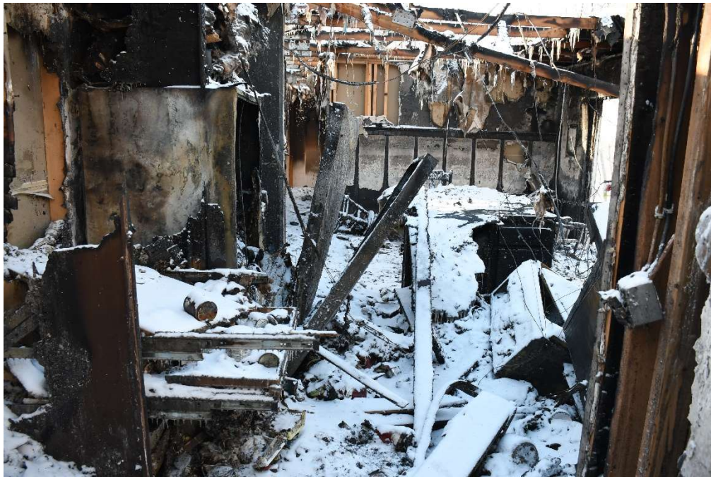
Figure 7 Photograph DSC_0106.JPG Top of Stairs, Kitchen Area

At the top of the stairs, on the north wall was the laundry room. To the west was the kitchen area. Most of the ceiling and roof assembly had collapsed or was consumed. The contents were covered in fire debris and snow. The remains of the refrigerator were noticed along the south wall of the kitchen area. (See Figure 7)