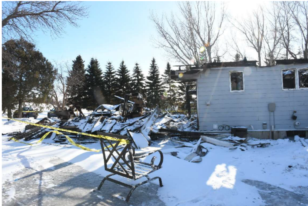
Figure 1 Photograph DSC_0001.JPG Exterior North Side, Garage Consumption/Collapse

Investigation Title: BURLINGTON NELSON FIRE