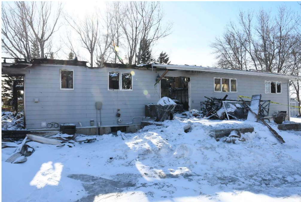
Figure 2 Photograph DSC_0003.JPG Exterior North Side, Residential Portion, Deck, Roof Remains

had collapsed or was consumed as extension went from the garage to the west. The soffit, eave, and fascia had collapsed or was consumed in the area closest to the garage. As extension continued west, less collapse and consumption occurred to the roof assembly. Approximately the center of the remaining wall was an opening where the patio doors were. Snow and ice covered wood deck extended north from the opening. Fire debris was along the west end of the deck. (See Figure 2)