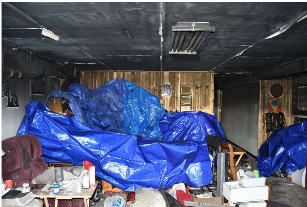
Figure 5 Photograph DSC_0037.JPG Basement Living Room, Furniture, Covered Furniture, Hallway

At the bottom of the stairs was a living room. Along the south wall was a sofa, recliner, coffee table, lamp and other miscellaneous furniture. A blue tarp covered the furniture along the west wall. Soot deposits were throughout the ceiling and extended approximately three feet down the south wall and west wall. Soot deposits and fire debris were noticed throughout the furniture.