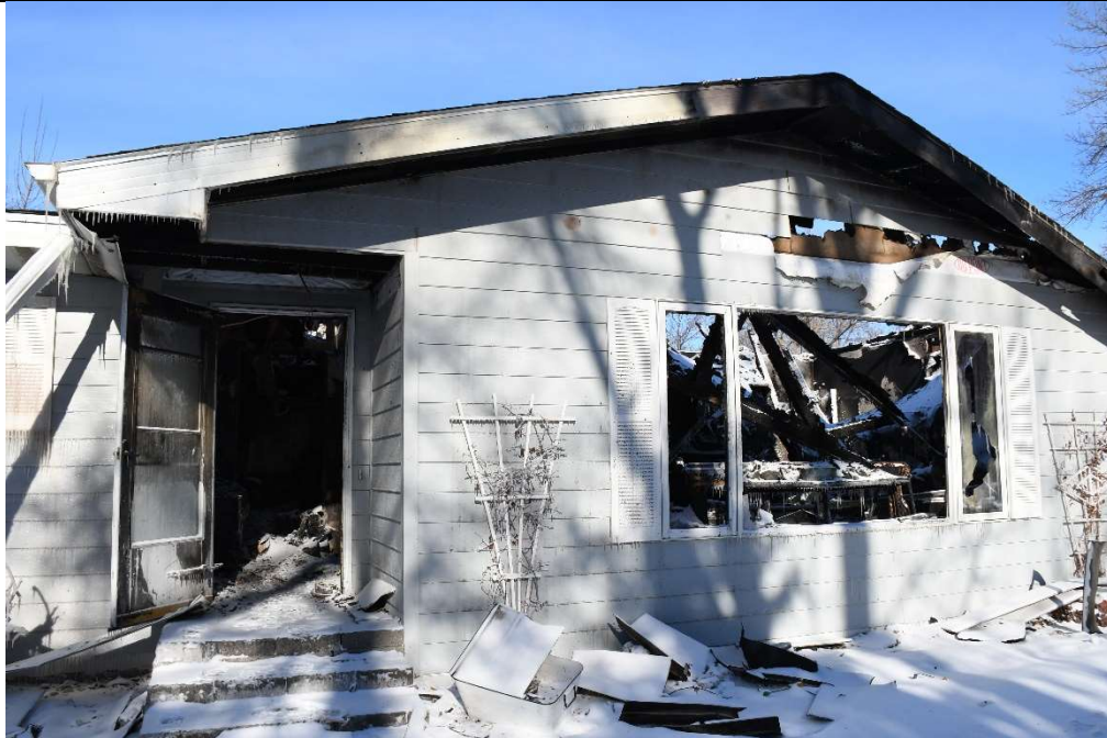
Figure 3 Photograph DSC_0015.JPG Exterior South Side, Main Entrance, Soffit/Facia Damage

Investigation Title: BURLINGTON NELSON FIRE